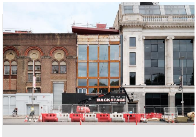
Current installation of the cladding on the front façade. Image by Haworth Tompkins.