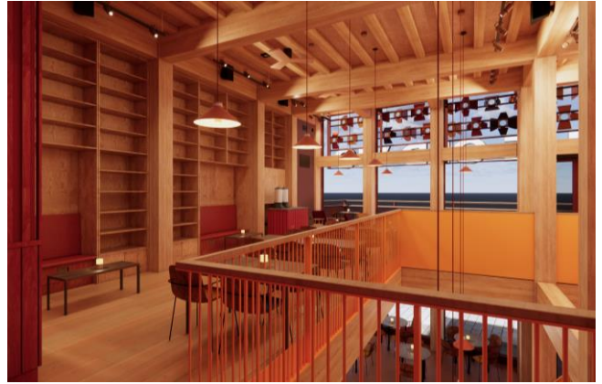
Script Library on the first floor.