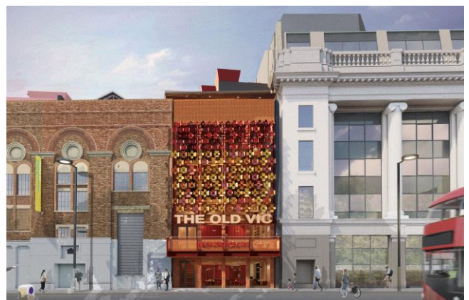
The Backstage façade. Image by Haworth Tompkins.